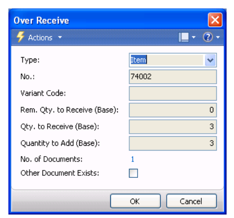
PO Line Over Receive Dialog

E-Receive enable over-receive capabilities, while reducing the administration time required when receiving. Enabling the quickest possible put-away time, it records the fact that there is an over-receipt, and provides the user with information if other relevant documents for the same item exist.